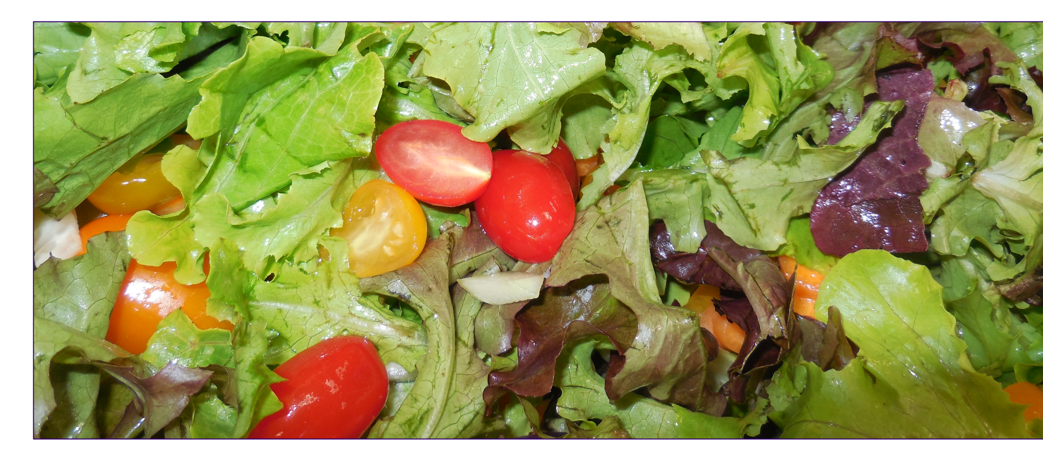
LOCAL PRODUCE FOR HEAD START LUNCH IN SPOKANE, WA