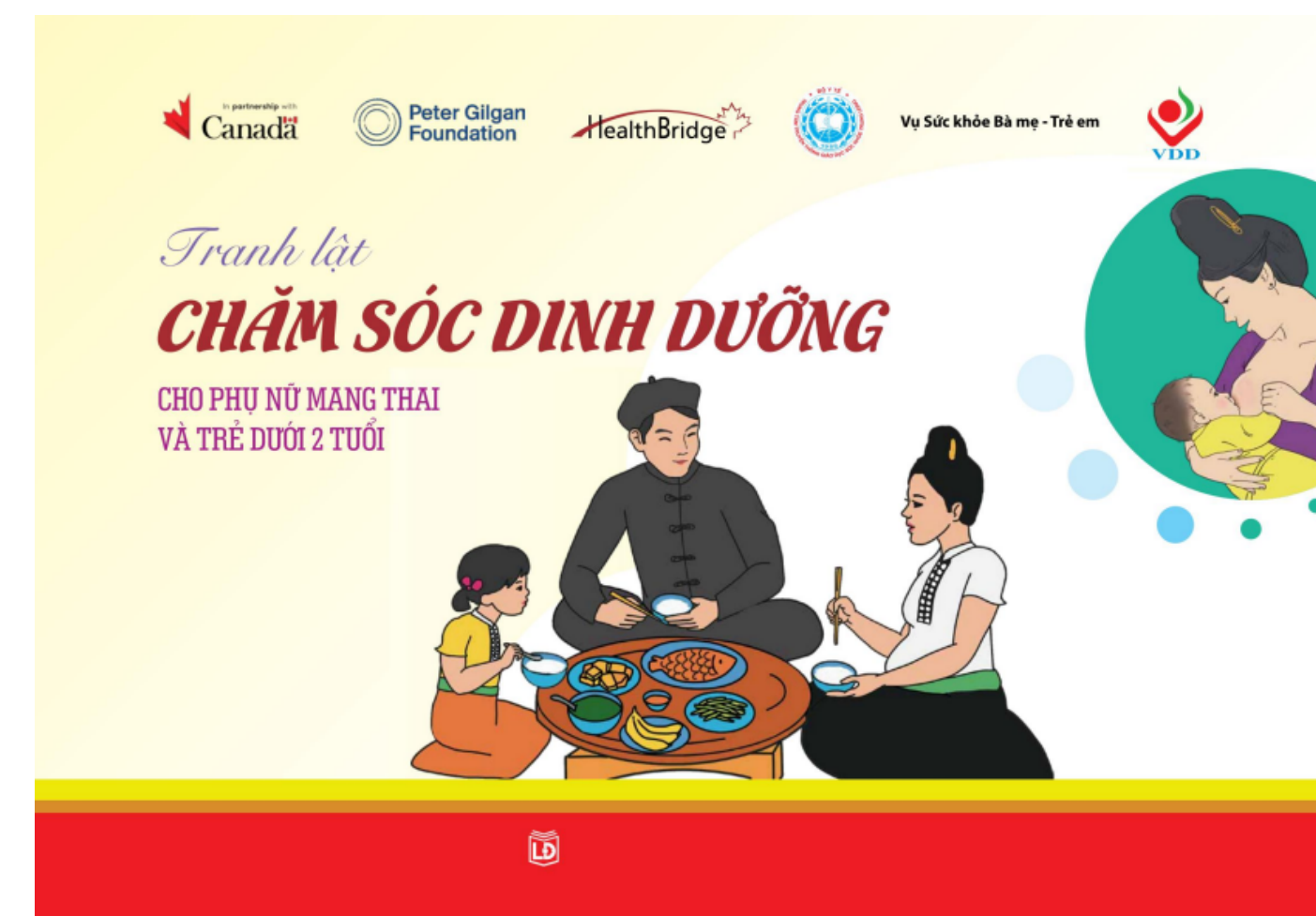
First page of the curriculum plan used to lead Nutrition and Food Demonstration sessions in various communities in Son La, Vietnam.

With Son La (community of implementation) being a primarily Thai population, and community educators being primarily Kinh, HB was interested in both effectiveness and appropriateness of the session design.