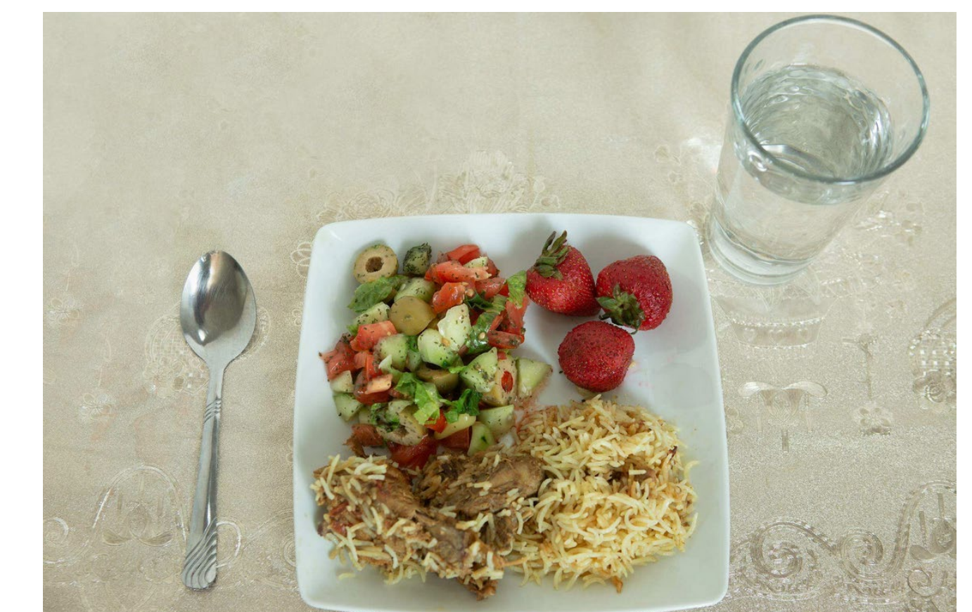
An example of a balanced Afghan food plate.