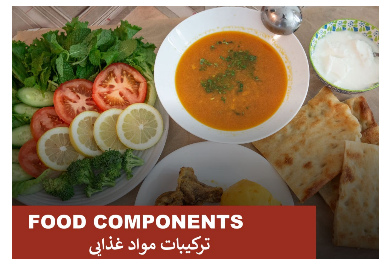
Food components section photography